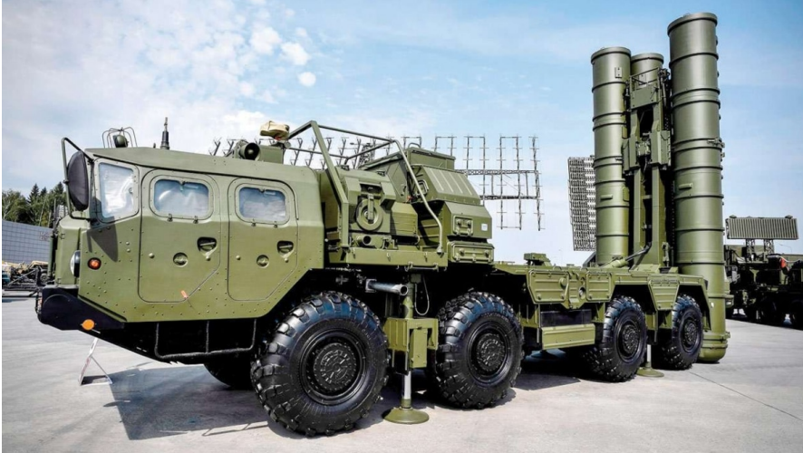
Russia and India signed a USD 5.43 billion contract for the supply of S-400 in October 2018

not invoked CAATSA against India with respect to S 400 Triumf air defence systems procurement deal, the situation could drastically change in view of Ukraine crisis. India's export order of $375 million BrahMos to Philippines would also be affected as it is joint venture between Russian NPO Mashinostroyeniya (NPOM) and Indian Defence Research and Development Organization (DRDO).