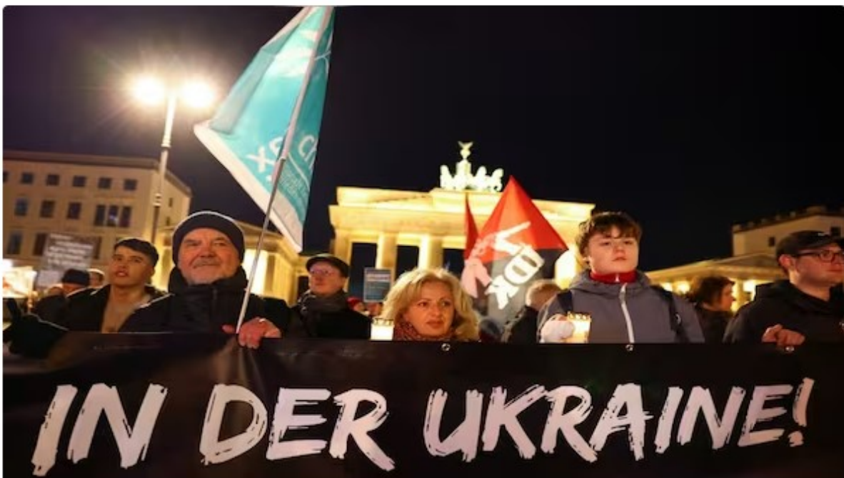
Protesters gather to demonstrate against the war in Ukraine.

Kyiv will fight on as long as the US and West continue to support it militarily and financially